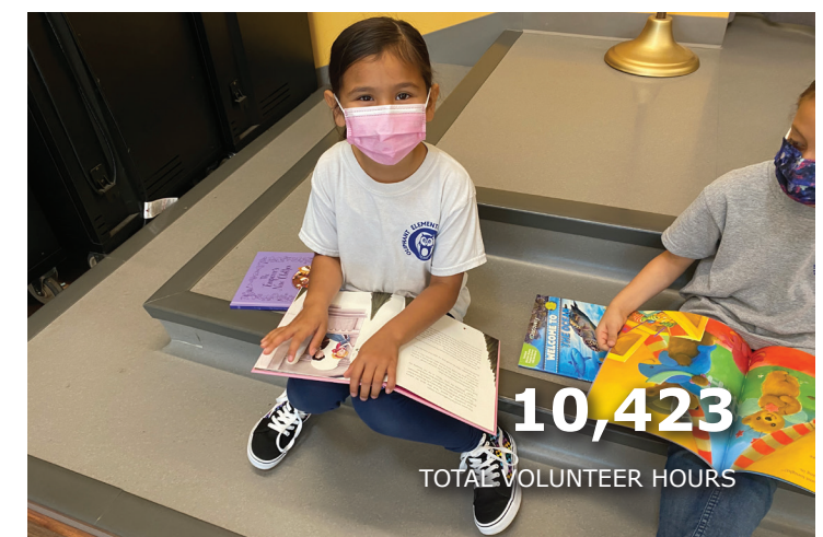
Happy student reading.

Our Read with Me volunteers were active in 17 schools in Coachella Valley and Northern Nevada in 2021-2022. The more than 2000 students who worked with Read with Me volunteers showed significantly higher reading gains compared to their peers without volunteer support. For example, at Incline Elementary School, those students who were most behind grade-level reading benchmarks received Read with Me volunteer support in the classroom and after school Reading Club, which helped them begin to close the achievement gap as these students showed the greatest reading growth in the school. In every participating school, students who worked with volunteers outperformed those students without volunteers sometimes as much as 4 times the growth! Read with Me continues to be a highly effective reading intervention for struggling readers and English language learners.