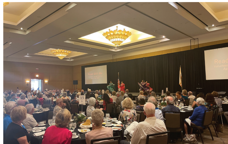
Celebrating our generous donors at our RWM Donor Luncheon.